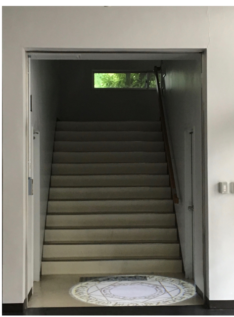
Fig. 2. Experimental condition: circular light of condition 2 (top) and magic circle of condition 3 (bottom).

In the experiment, we projected the light on the spot indicated by \bf A in Fig. 1 and observed how pedestrians changed their behavior. The experimental conditions were as follows.